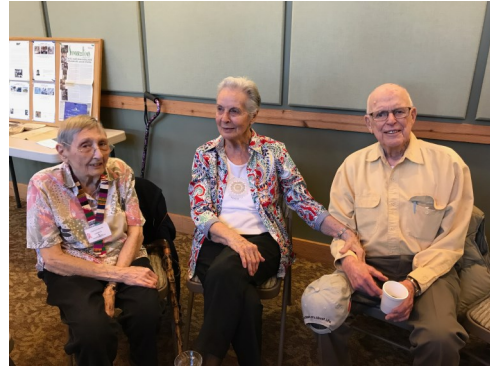
Some of Avenbury's first residents