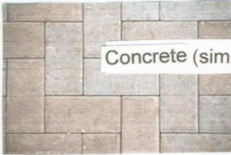
Concrete (similar to Avenbury mailbox paver colors)