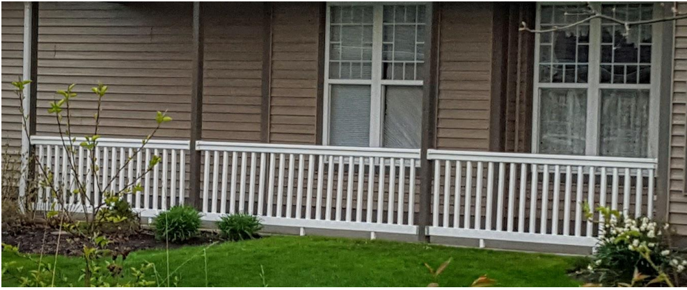
VINYL - PAIRED VILLA