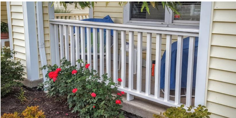
WOOD - GARDEN HOME - ASTER