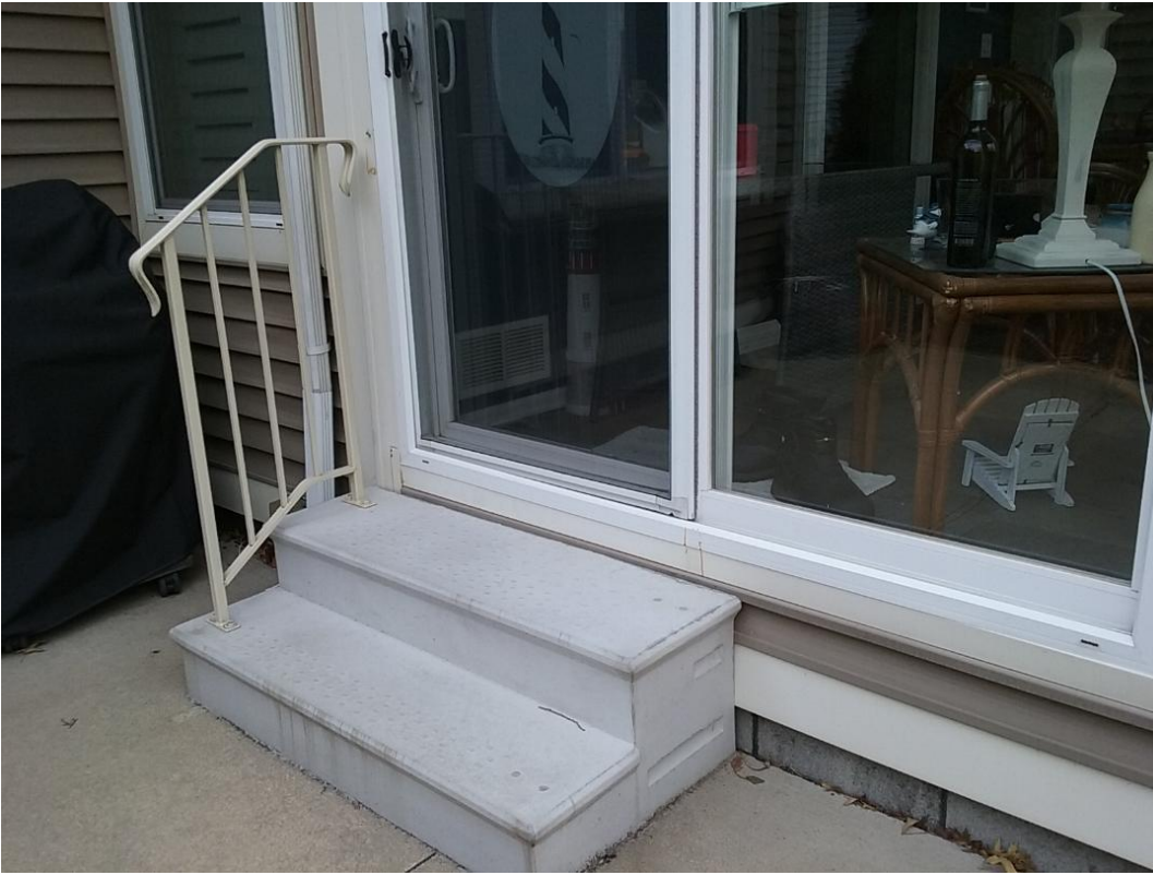
Back patio door - 48-inch-wide precast concrete with single iron handrail