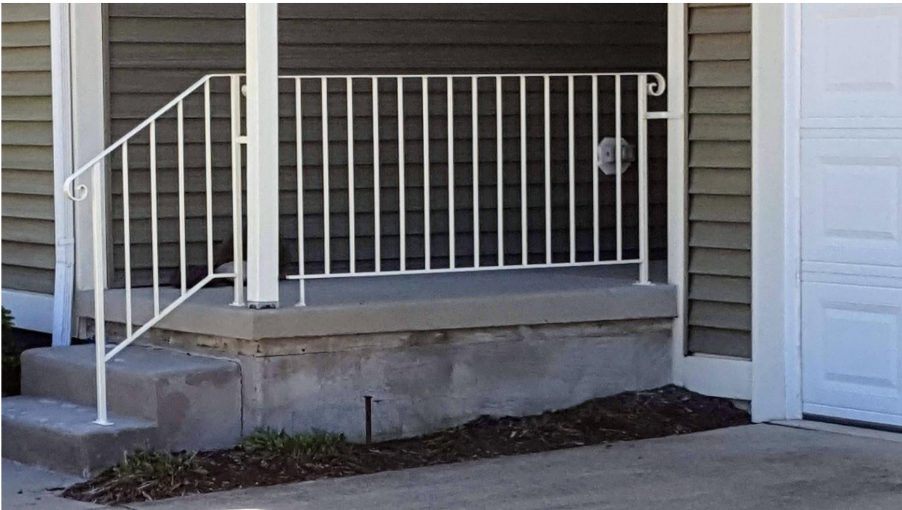
IRON - TRILLIUM