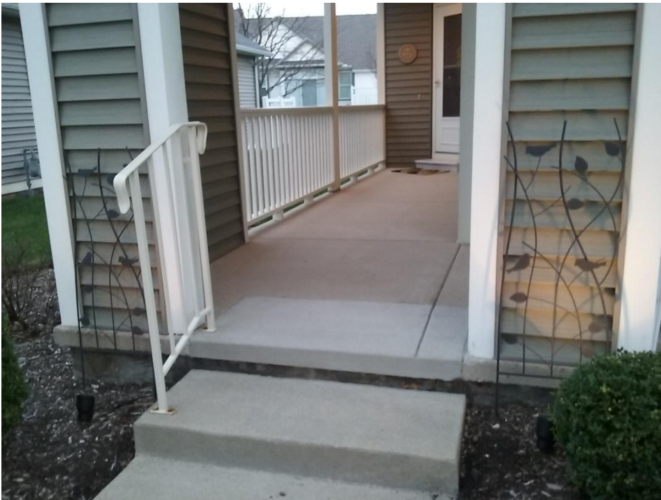
SINGLE HANDRAIL - ASTER