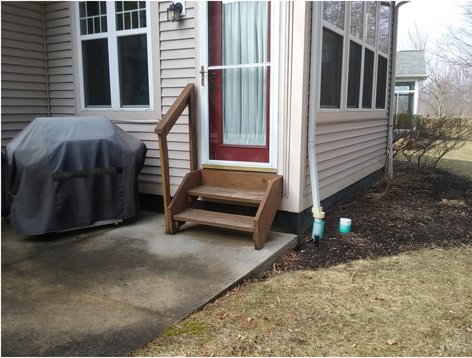
Wood steps from back sunroom door