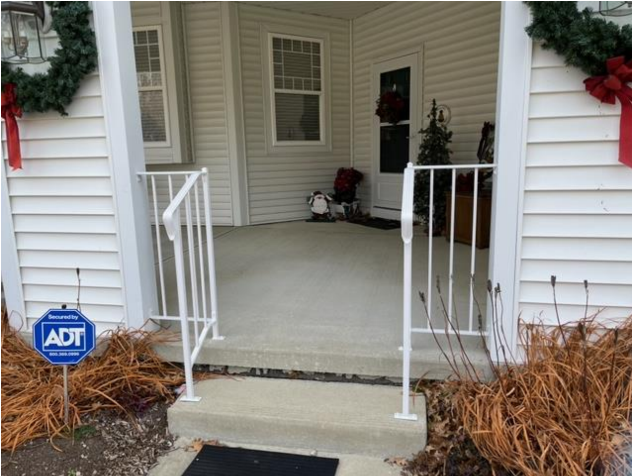
DOUBLE RAILING - AMERICAN STAR