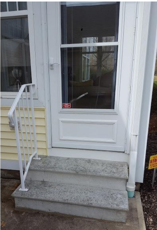
Back sunroom door - 48-inch-wide precast concrete with a single iron handrail