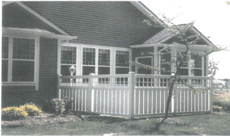
4'5" tall and comes in 6 or 8 ft. sections Vinyl spaced "Good Neighbor" with square lattice